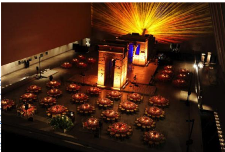
The Temple of Dendur