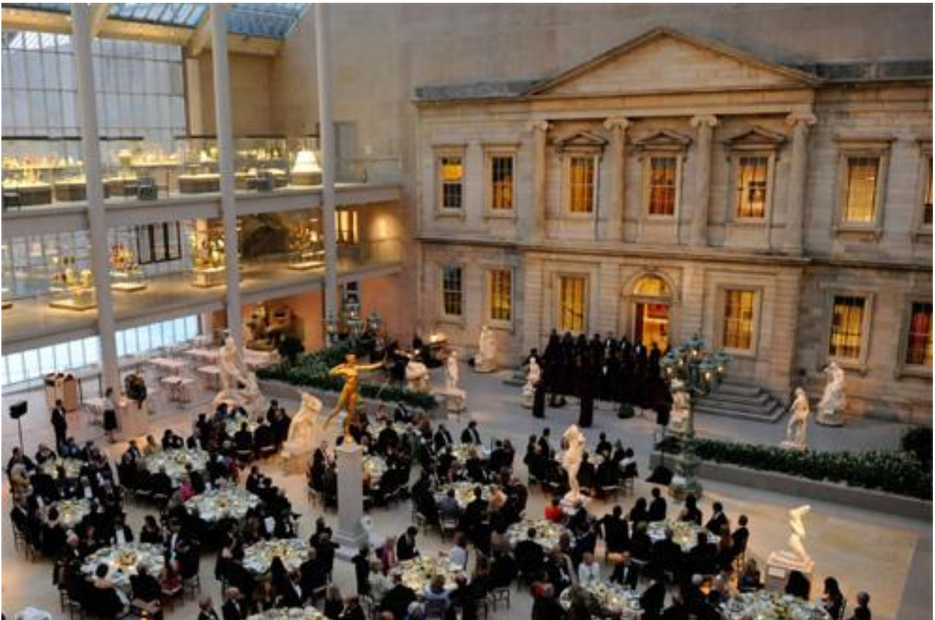
The Charles Engelhard Court in the American Wing